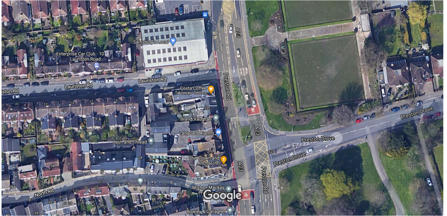
Imagery ©2021 Bluesky, Getmapping plc, Infoterra Ltd & Bluesky, Maxar Technologies, Map data ©2021 20 m